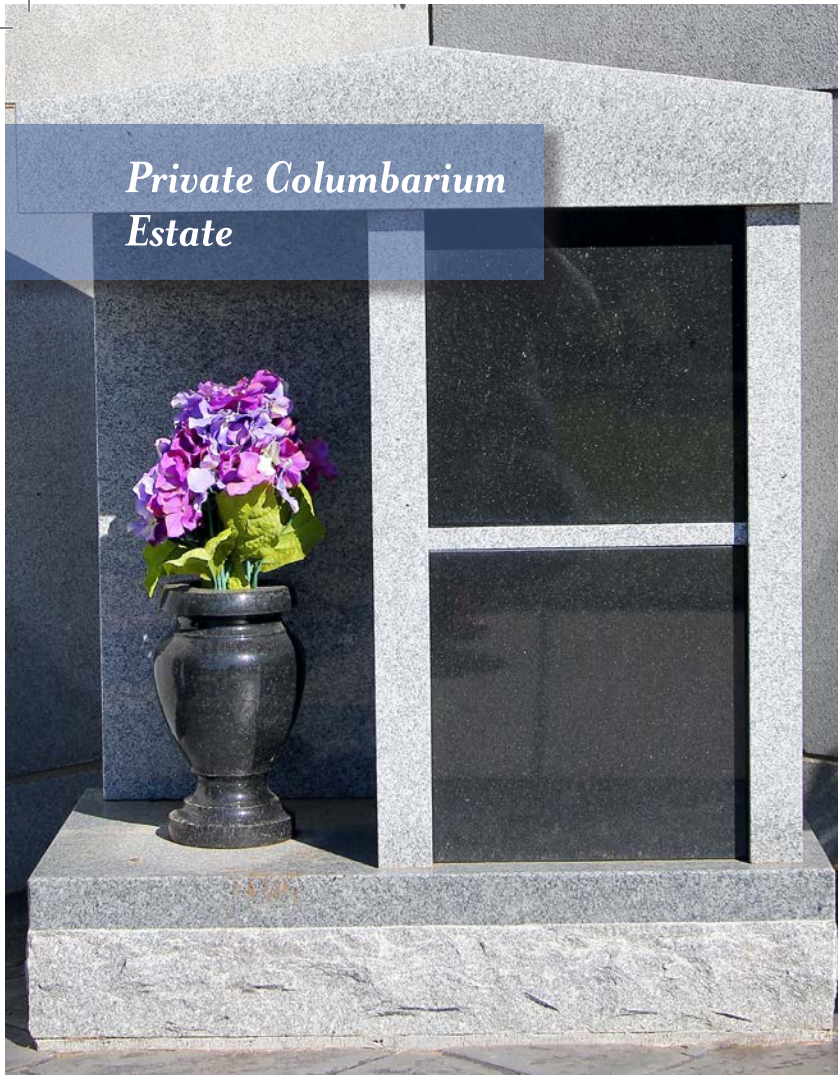
Private Columbarium Estate