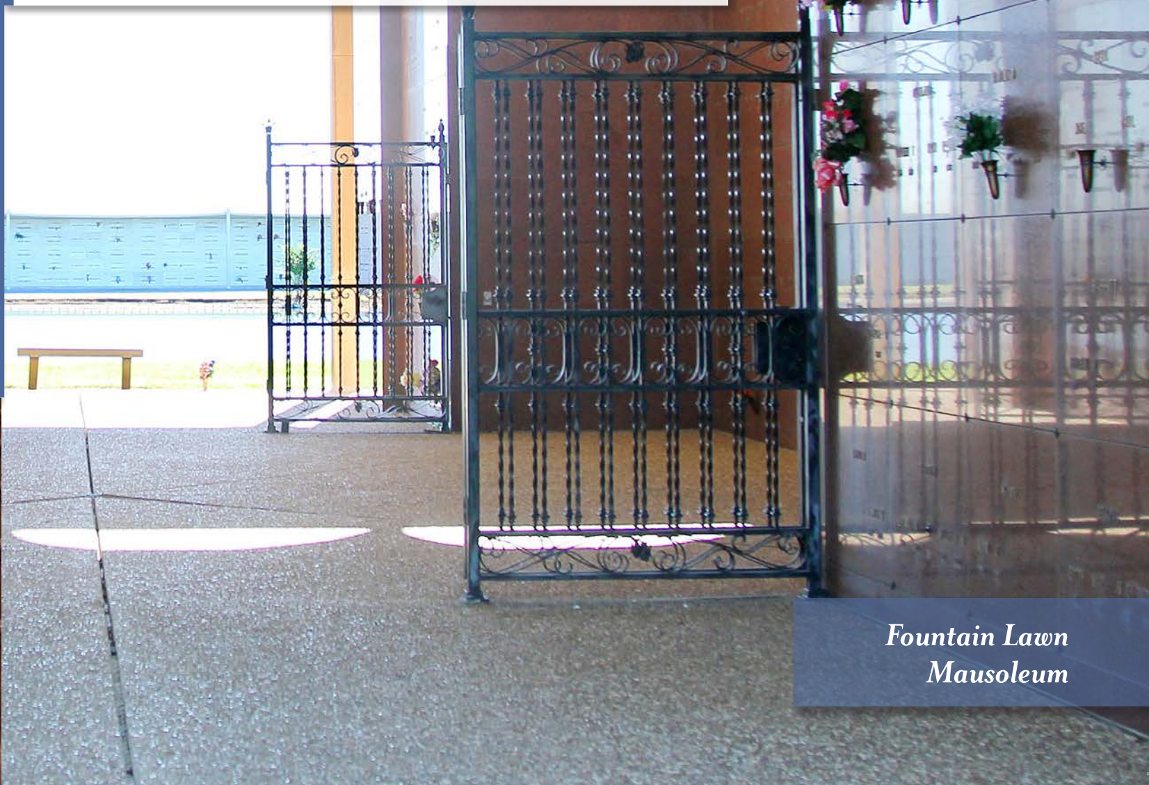
Fountain Lawn Mausoleum